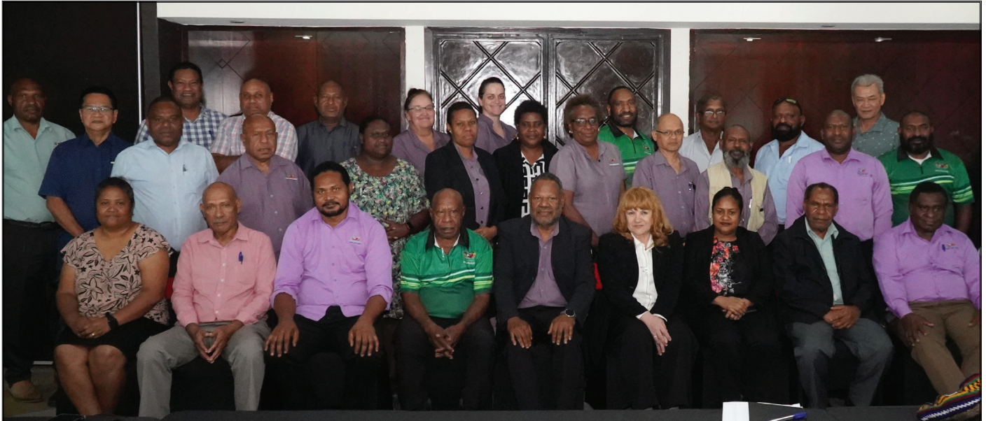
AGO staff and European consultants pose for a group photo following the GAP Analysis Validation Workshop held at the Grand Papua Hotel, Port Moresby.