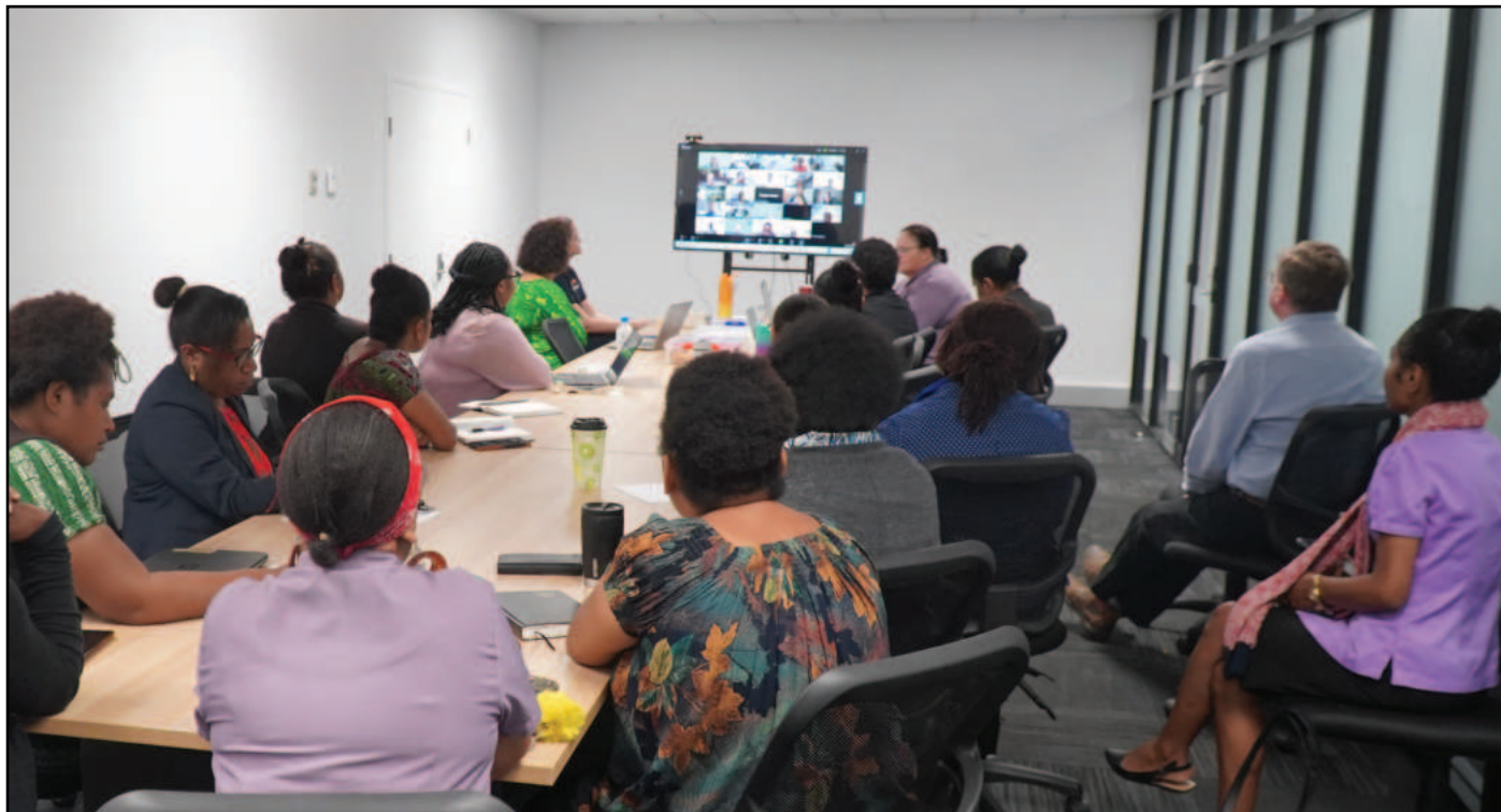
AGO female staff and PASAI executives joined in a special webinar to foster collaboration.

In celebration of International Women's Day, female staff from the Auditor General's Office (AGO) and executives from the Pacific Association of Supreme Audit Institutions (PASAI) came together for a special webinar on March 6, 2025.